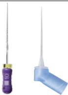
ReadySteel K-File 10 TruNatomy Irrigation Needle

Scout 2/3 of the canal in the presence of a lubricant.